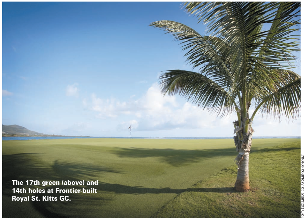
The 17th green (above) and 14th holes at Frontier-built Royal St. Kitts GC.

And the members? "They can't stop raving about them."