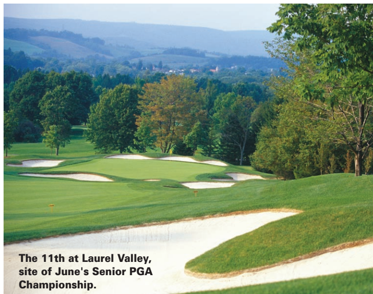
The 11th at Laurel Valley, site of June's Senior PGA Championship.