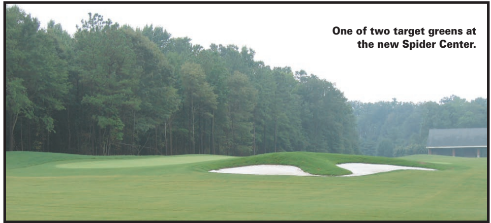
One of two target greens at the new Spider Center.